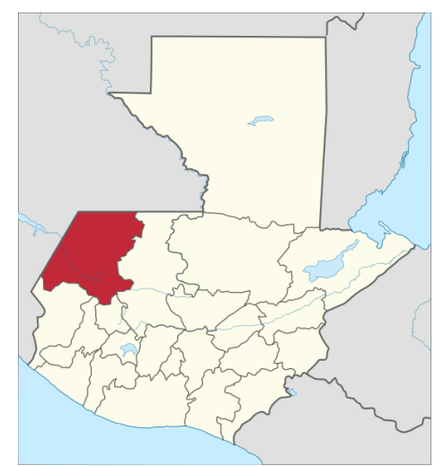
Location of Huehuetenango, Guatemala

country, close to Mexico. It has diverse landscapes with mountains and hills rising more than 3,500 meters in the Sierra de los Cuchumatantes, and lower lands at 300 meters. The weather is diverse due to differences in land elevation.