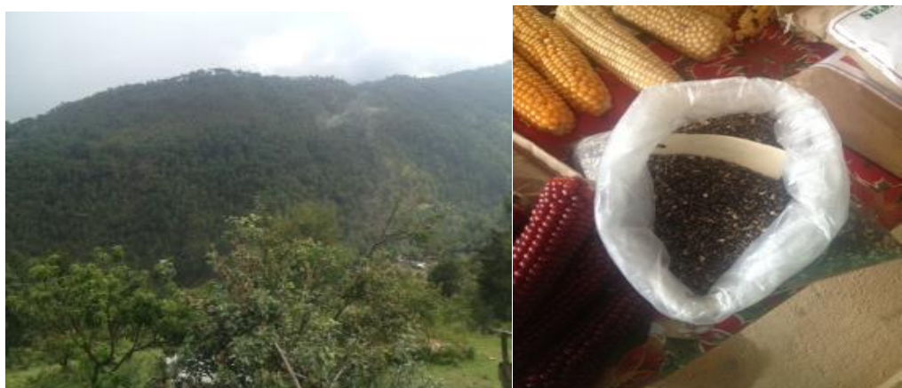
SIERRA DE LOS CUCHUMATANES JUANITA CHAVES POSADA 2013

TEOCINTLE SEEDS- JUANITA CHAVES POSADA 2013